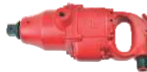
CP-610-RP IMPACT WRENCH