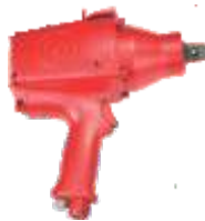
CP-606-RS IMPACT WRENCH

Each wrench is specially designed to withstand tough use and feature CP proven clutches which give you the long lasting durability you expect from CP.