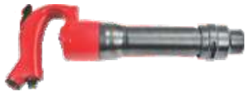
CP-4123 CHIPPING HAMMER

CP offers one of the most comprehensive range of hammers available today. These are powerful and versatile most suited for chipping, riveting and rivet cutting. CP rammers ensure more uniform sand compaction in the mould increasing productivity in foundries. So whether you need to rivet or chip, cut or clean, you will find the tool you need in CP's power packed range.