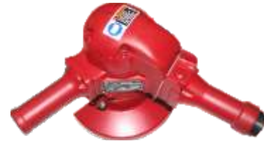
CP-319-A GRINDER / VERTICAL SANDER