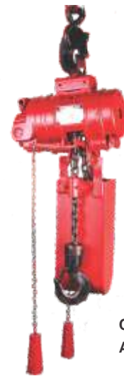
CP-1100 AIR HOISTS

Note : Chain & Buckets for extra chain length will be optional at additional cost as applicable.