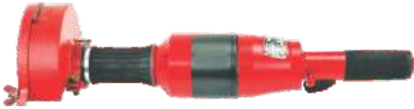
CP-3140-B HEAVY DUTY GRINDER